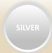
Silver - $500

1/4 page ad in season media guide, announcer spot at all Crusader home games, and a 300x100 banner on the carolinacrusaders.org sponsors page