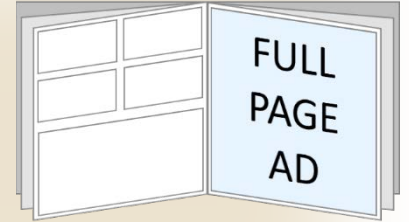
FULL PAGE - 8" x 10.5" - $150.00

For Business Card and Half Page ad sizes a standard business card is acceptable. All personal or inspirational ads will be reviewed by the Carolina Crusaders board. Please submit a MS Word or PDF of any other type of ad or Full Page ad. Ads can also be emailed to info@carolinacrusaders.org please ensure the player/cheerleader registration number is in the subject line. All ads will be printed grayscale.*