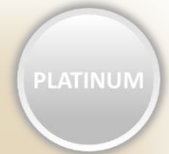
Platinum - $1000

Full page ad in season media guide, announcer spot at all Crusader home games, 600x300 banner on the carolinacrusaders.org sponsors page, and game day signage at the concession stand