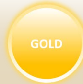
Gold - $750

1/2 page ad in season media guide, announcer spot at all Crusader home games, and a 600x160 banner on the carolinacrusaders.org sponsors page